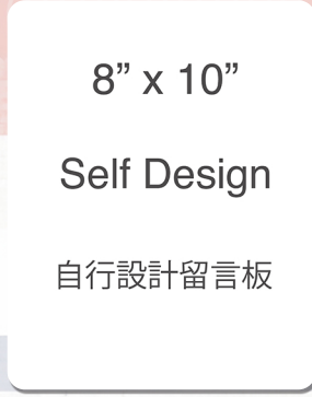
8" x 10" Self Design 自行設計留言板