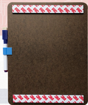
套裝已包含：2 對柔性磁貼 及 1 支白板筆