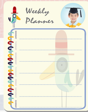
Design 3 設計模版 3