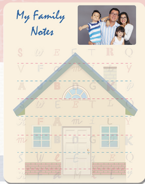
Design 1 設計模版 1